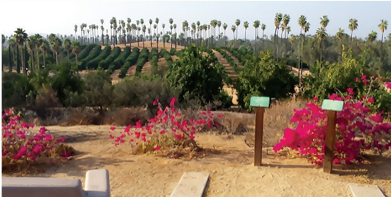
View of the groves at Citrus State Historic Park, Riverside, California.