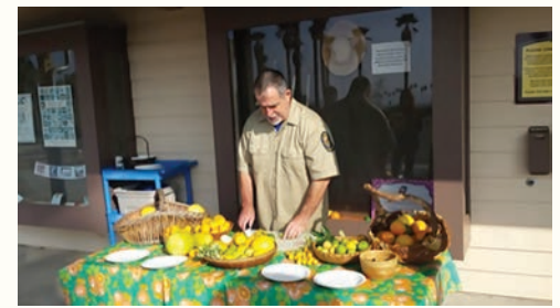
Volunteer docents treat visitors to a free tasting of dozens of citrus varieties grown on site. Guided “Tour and Taste” events are free and open to the public Friday through Sunday.