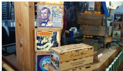
Inside the visitor center at Citrus State Historic Park, Riverside, California.