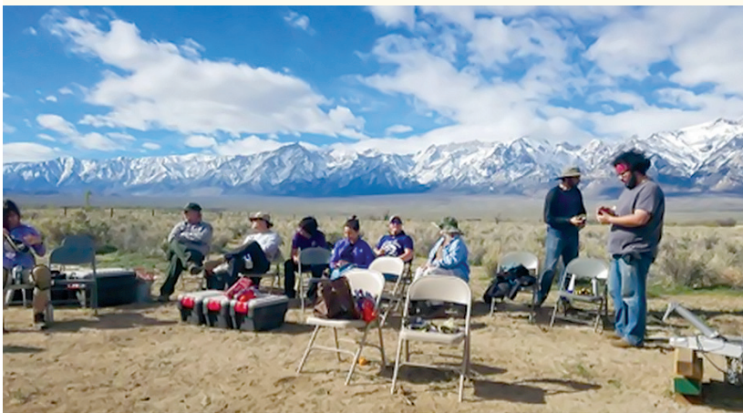
Students, faculty, staff, and other volunteers take a break in their work and take in the view at the Manzanar National Historic Site.

By offering our help, we are assisting in the preservation of the history of Manzanar. I strongly recommend this experience to anyone. The trip was an experience that I will never forget. ■