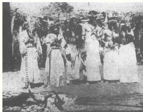
The photo and caption are from the Major James McLaughlin Papers in the CSUSB Pfau Library, from the newspaper, The Spokesman-Review (Spokane, September 2, 1936).

Please visit the fourth floor of the Pfau Library to view our display on this collection, as