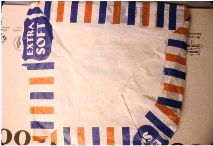
Source.graphic bread wrapper