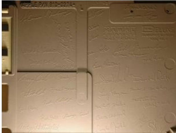
Figure 2. Inside the back case of the 1984 Mac (Tweedie, 2004)