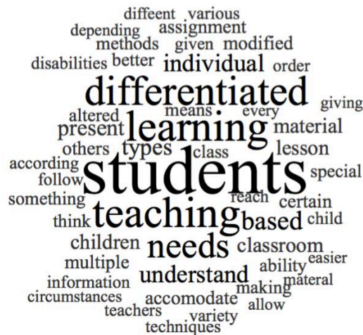
Figure 4. Word cloud of most frequently used words to define differentiated instruction.

interesting statement from three participants stated that, "...differentiated instruction is totally different instruction than instruction for students with disabilities". Lastly, participants were asked, "What is an evidence-based practice"? 61% of participants were able to answer this question with 39% of respondents answering that they either 'didn't know' what an evidence-based practice was, or gave unsystematic answers such as: "Volunteering at a school"; "Working in your own time"; and "Actual hours working with something in a chosen field". This information also coincided with the perceptions regarding the number of hours required for professional development when an in-service teacher. Answers were widely scattered with participants simply 'not knowing', to stating '...as little as 8 hours per year' or '1000 hours per year'. Figure 4 depicts a word cloud generated with the most frequently occurring words from answers given.