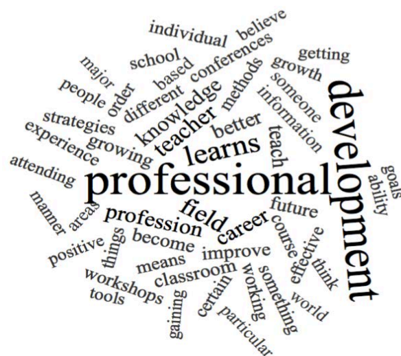
Figure 3. Word cloud of most frequently used words to describe professional development.

When asking participants ' What is professional development? ' an array of answers was given. The most frequently occurring theme revealed that 40% of participants did not have a clear understanding to what PD actually was. Examples of specific statements from participants included: " PD is how to behave on social media and what not to wear "; " Helping you to decide your major "; and " All types of students in the same classroom ". In addition, 23% of participants viewed PD as 'Useful information about various classroom aspects' and 20% of participants perceived PD as 'new tools to increase knowledge'. The remainder of answers coded was sparse in findings and included statements such as, 'making yourself [sic] better' and 'becoming and expert'. Figure 3 below depicts a word cloud generated with the most frequently occurring words from answers given.